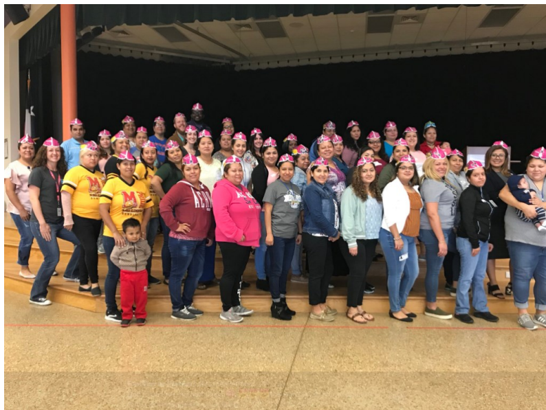
Photograph of parents and staff wearing paper models of the brain they assembled at the March 2018 SEL parent camp.